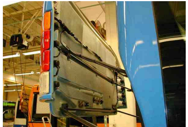
Figure 2 Coach rear Access Panel with MM inserts